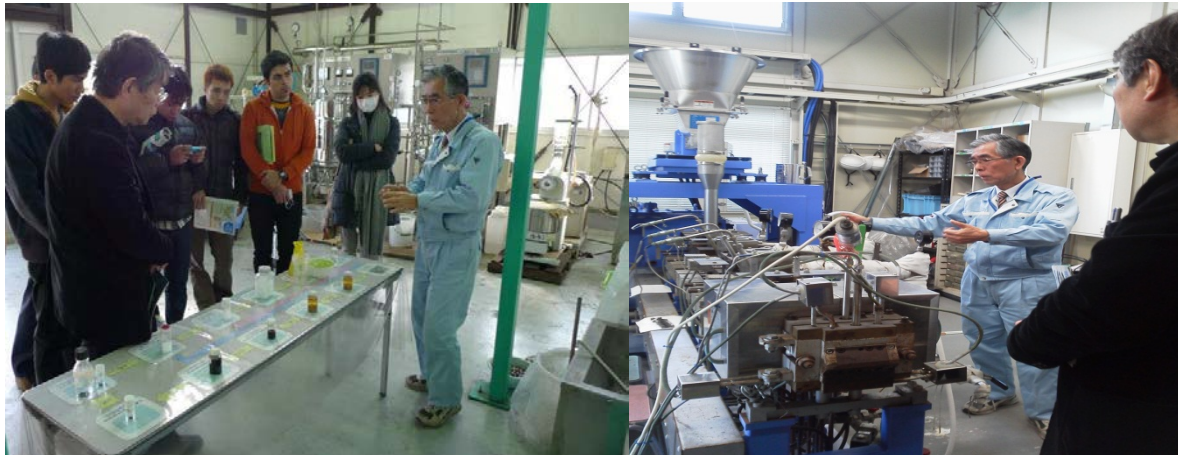
Research Demonstrations Producing Lactic Acid from Food Waste